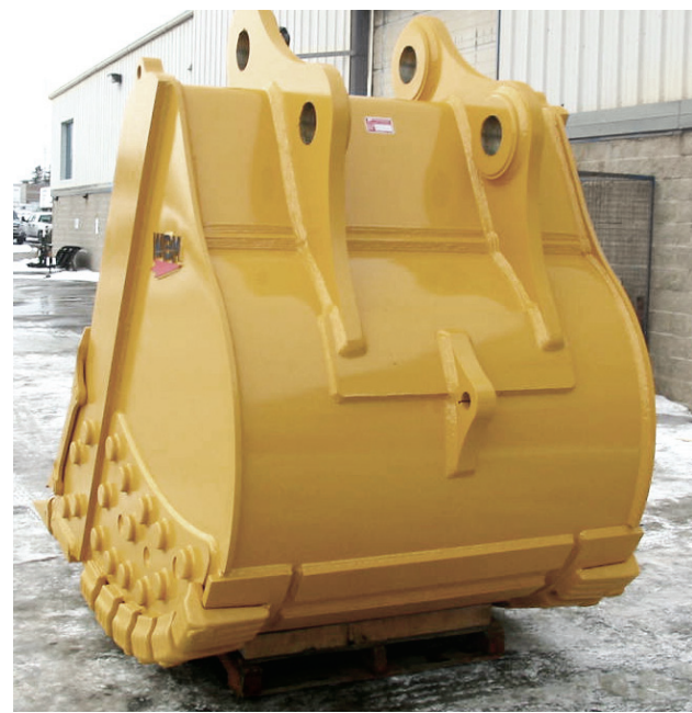
Shown with optional spade lip

WBM Extreme Service Rock Buckets (Road Builder Buckets) are impact/abrasion resistant, designed with even further increased wear resistance to withstand extreme wear conditions in rock and quarry environments.