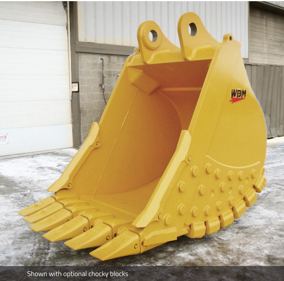
Shown with optional chocky blocks