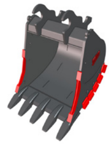
Heavy Duty Digging Bucket