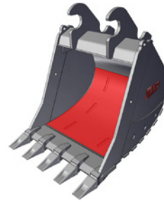
Extreme Service Bucket