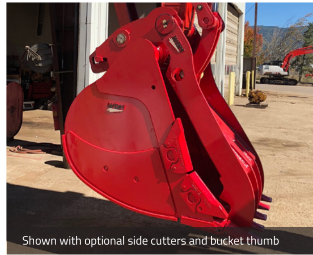
Shown with optional side cutters and bucket thumb

WBM's Heavy Duty Digging Bucket works in all general purpose and heavy-duty digging applications.