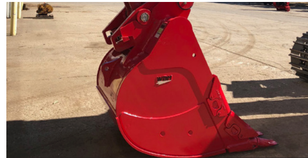
Shown with optional side cutters