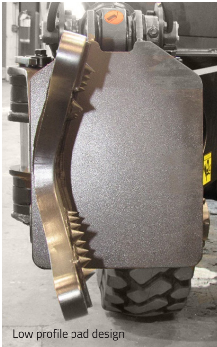
Low profile pad design